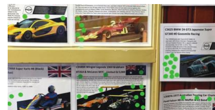
A selection of the Cool Wall posters after voting had started and indicating some car releases more popular than others.