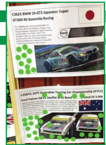
The #7 voted C3625 BMW Z4 GT with Pro Chassis Racing (PCR) and the #1 voted, top choice, C3587A Ford Falcon XB twin car limited edition set.