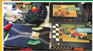
Older interesting items were available, here we have two Goodwood Chicanes and some 1960s sets.