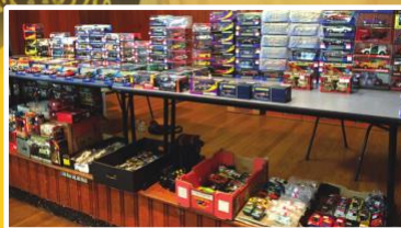
One of the well-stocked stalls at the swap meet prior to doors opened. Showing mix of recent releases, collectable long sold out cars and some unboxed keenly priced items.