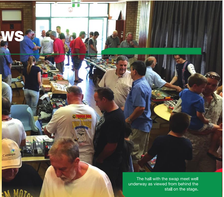
The hall with the swap meet well underway as viewed from behind the stall on the stage.

2015 saw a better variety and more slot car items at assorted prices, there was clearly more buying and swapping happening. The promotion of the 2015 event highlighted the possibility of swapping cars to exchange for something new to your 1:32nd garage without dipping into your pocket. We were pleased to see a number of people bring in cars looking to swap. By the end of the swap meet some of these exchanged cars had found their third owner in the same day! By 1pm the buyer activity had dropped off so the trading amongst sellers picked up as did the interest in the Cool Wall. With the doors closing at 2pm, another enjoyable and successful club swap meet had been run and thoughts would soon shift to 2016!